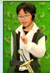
English Drama 英語話劇