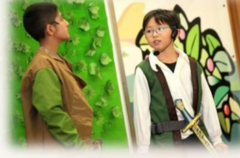
There's something on your head