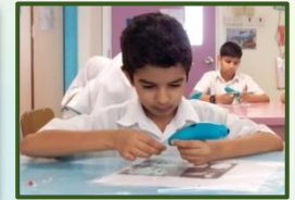
3D Creative Arts 3D創意藝術

IDPMP's Campus TV was successfully launched on 27 April. We are currently providing three channels: Language, News & Science and Infotainment. With the cooperation of our professional Team, our kids can enjoy a variety of programmes every day. School reporters, you have done a great job!