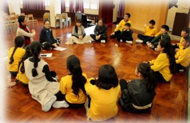
Judges feedback time.