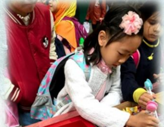
Chinese Culture Day: everyone had fun with all food, booths and lucky draw.