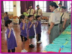
Grasshopper Scout 小童軍