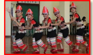
Chinese Dance 中國舞