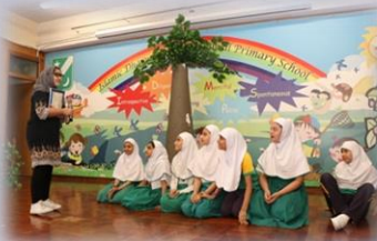
We'll be good Miss