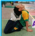
Art gymnastics 藝術體操