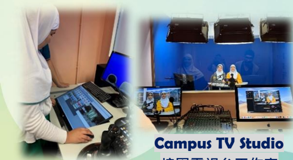
Campus TV Studio 校園電視台工作室