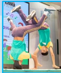
Free running 飛躍道