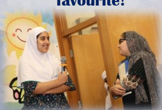
Just having a good