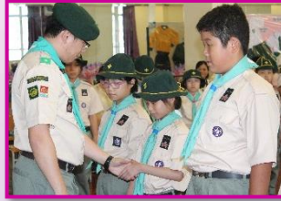
Cub Scout 幼童軍