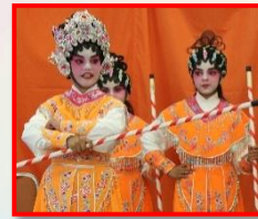
Cantonese Opera 廣東粵劇