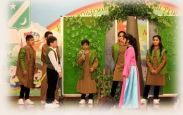
The gangs all here!