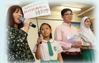
Introducing channels 頻道介紹