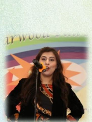
I can speak in Cantonese 我哋係用廣東話傾嘢