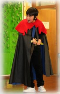
Ready for a