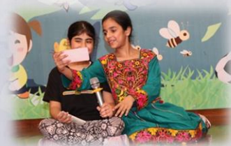
And this is a picture of my favourite!