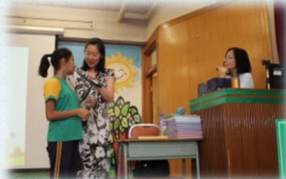
I want to be a writer! 你好，我也想當作家！