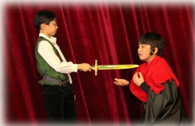
Don't hurt me Robin!