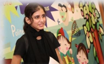
Such a pretty smile!