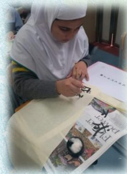
After winning the Chinese Penmanship Competition, I am now learning the Chinese Calligraphy.