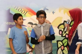
Are these glasses real?