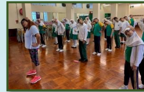
Wellness Team 正向小組