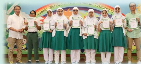
School Reporter Team 校園小記者