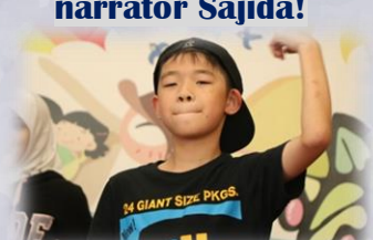
Super cool Acius!