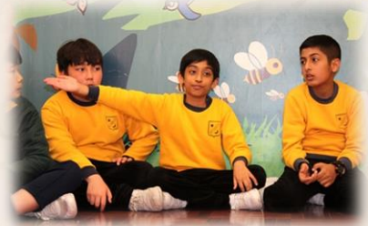
He went that way!