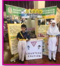
Road Safety Patrol 交通安全隊