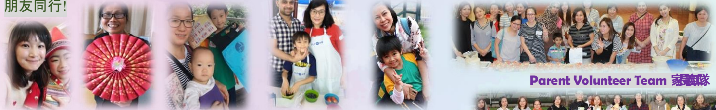
Parent Volunteer Team 家義隊

本年成為家教會主席，看見越來越多家長加入義工行列，實在感恩；小朋友看見爸媽同場出席，也感到十分興奮。在此機會感激家長的不辭勞苦和積極參與。盼望日後能更有更多家長一同加入伊鮑小的大家庭，與學校同心，與小朋友同行！