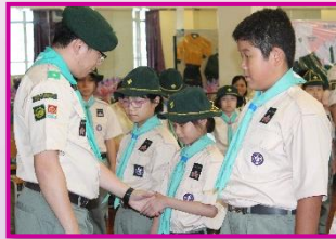
Cub Scout 幼童軍