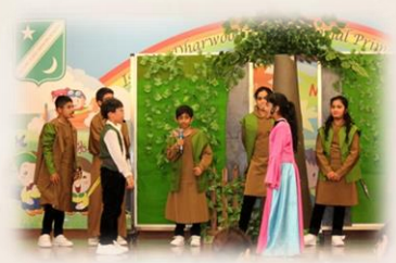
The gangs all here!