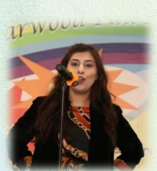
I can speak in Cantonese. 我也能用粵語朗讀