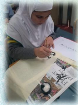
After winning the Chinese Penmanship Competition, I am now learning the Chinese Calligraphy.