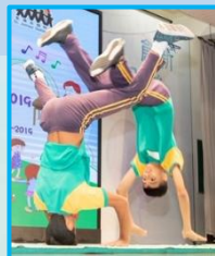
Free running 飛躍道