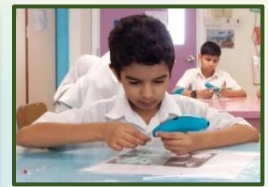
3D Creative Art 3D 創意藝術

IDPMPs Campus TV was successfully launched on 27 April. We are currently providing three channels: Language, News & Science and Infotainment. With the cooperation of our professional Team, our kids can enjoy a variety of programmes every day. School reporters, you have done a great job!