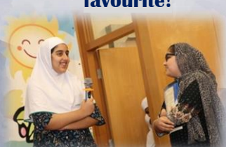
Just having a good chat.