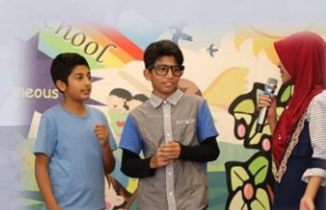
Are these glasses real?