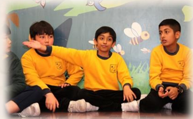
He went that way!