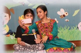
And this is a picture of my favourite!