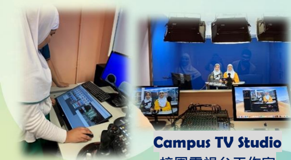
Campus TV Studio 校園電視台工作室