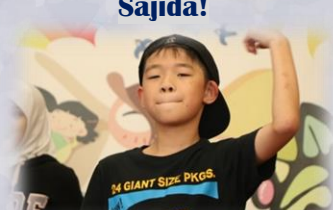
Super cool Acius!