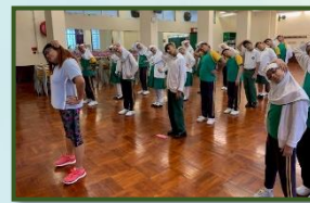
Wellness Team 正向小組