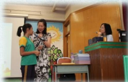
I want to be a writer! 你好，我也想當作家！