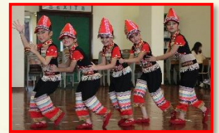
Chinese Dance 中國舞