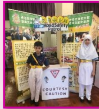
Road Safety Patrol 交通安全隊