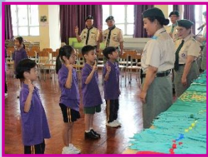
Grasshopper Scout 小童軍