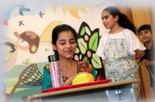
Thanks Mum! Breakfast!

This year we decided to try something different. In groups, students needed to create a drama using a selected Aesop's fable as their starting point. The talent quest once again, showcased our students' English language abilities. IDPMP's has many talented students! IDPMP's students voted 6A "Finders Keepers" as the best performance of the afternoon. Congratulations! Students enjoyed the show and spoke English confidently.