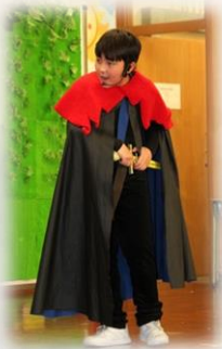
Ready for a fight.