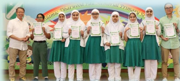
School Reporter Team 校園小記者