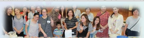
Parent Volunteer Team 家長義工隊