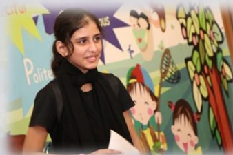
Such a pretty smile!