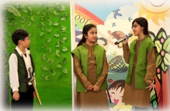
Listen up everyone!